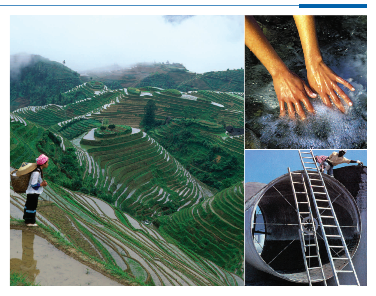
Discussion Document for the World Economic Forum Annual Meeting 2008